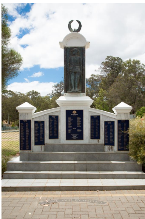
Greenbushes War Memorial

G. Hines is remembered on the Greenbushes War Memorial, located in Thompson Park, Blackwood Road, Greenbushes, Western Australia.