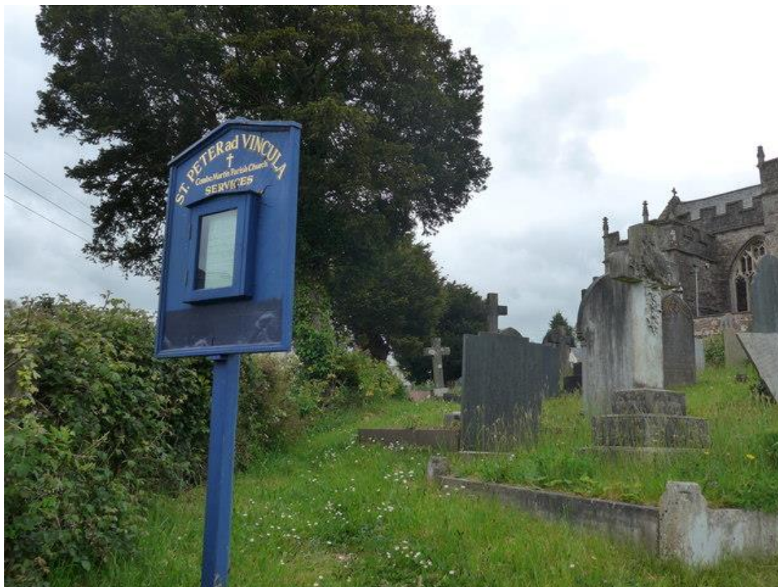
St. Peter Ad Vincula Churchyard, Combe Martin

St. Peter Ad Vincula Churchyard, Combe Martin, Devon contains 2 Commonwealth Burials from World War 1 & 7 from World War 2, one of which is an unidentified seaman of the Merchant Navy. (Information from CWGC)