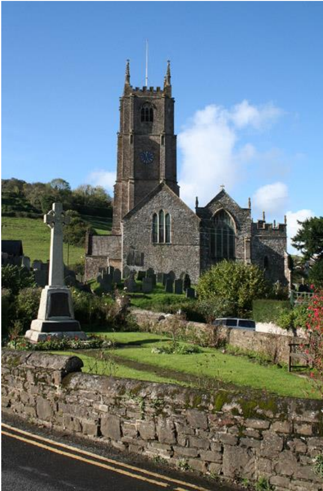
St. Peter Ad Vincula Churchyard, Combe Martin