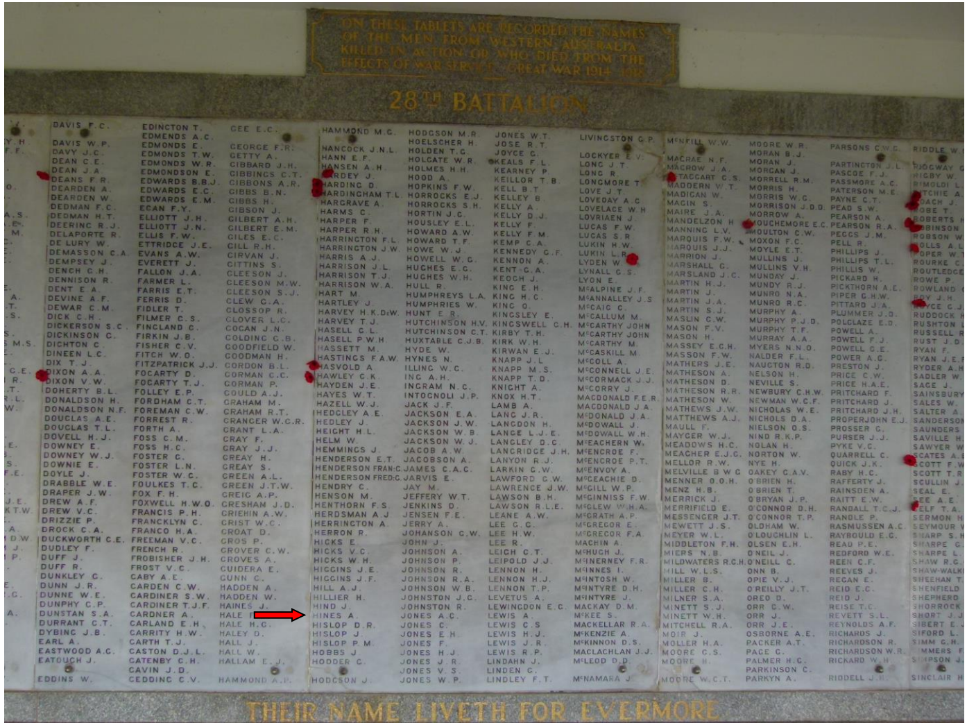
28th Battalion Panel

(86 pages of Private Augustus Hines' Service records are available for On Line viewing at National Archives of Australia website).