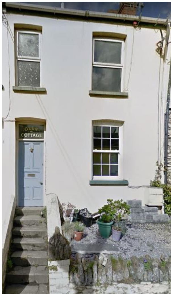
Glen Cottage, Combe Martin